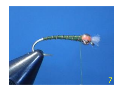
Tight Lines & Good Luck!